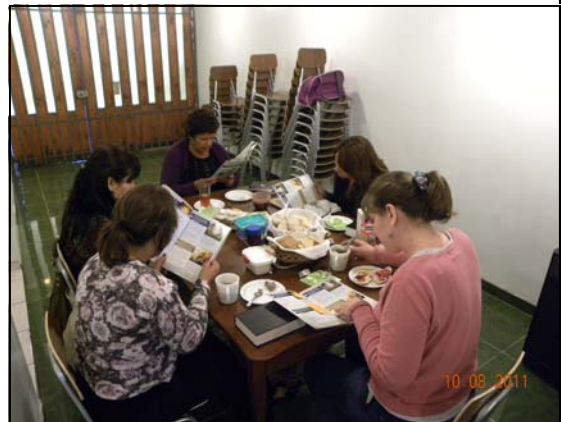
Very first Ladies Bible Study at Berea Baptist on October 8th.